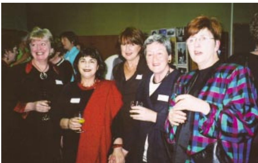
Happy faces at the 1960's Reunion