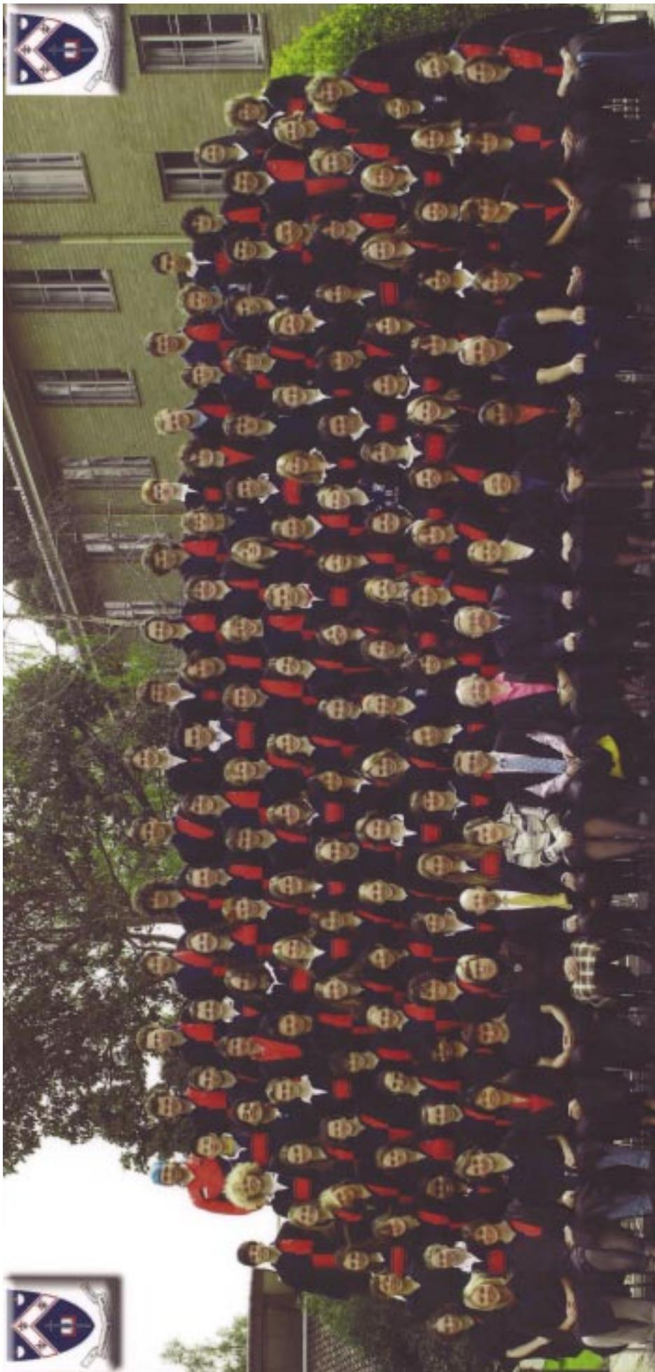
College residents 2005 in a formal pose