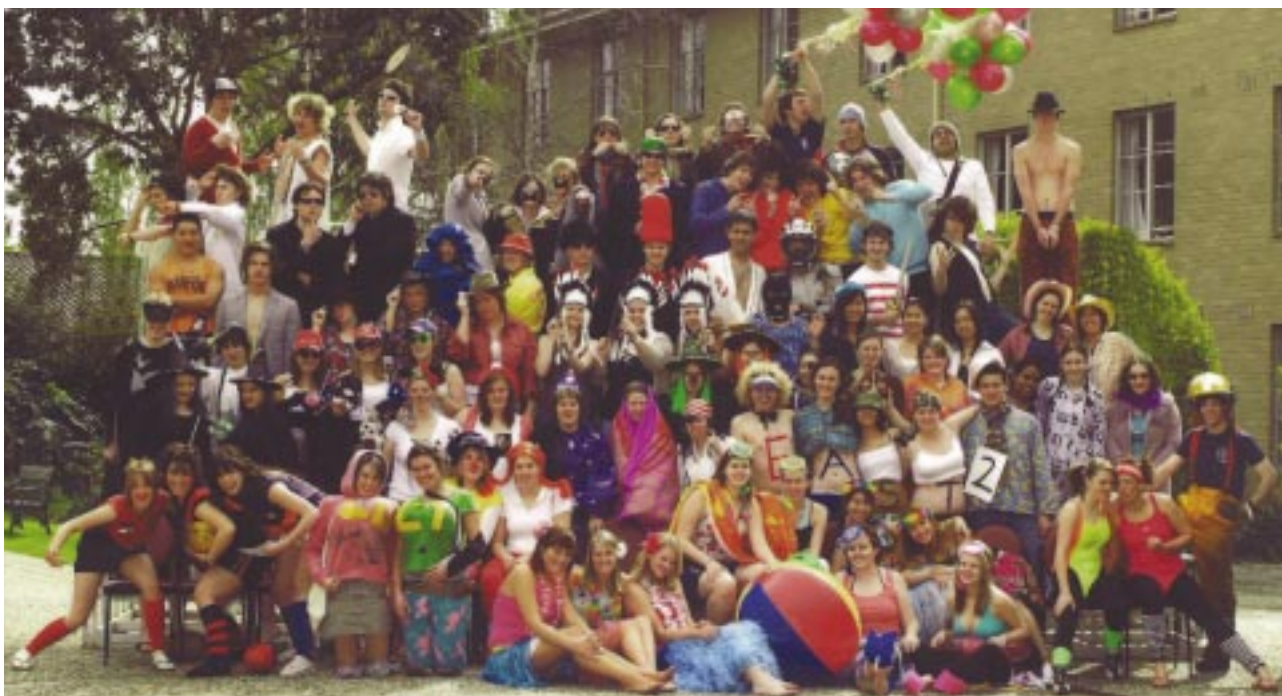
College residents 2005 in an informal pose