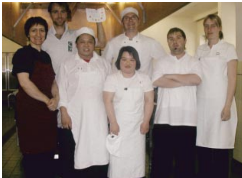
RMIT students with St. Mary's catering staff