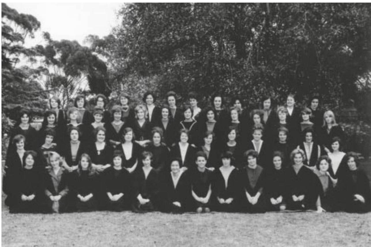
Students of St. Mary's Hall 1963